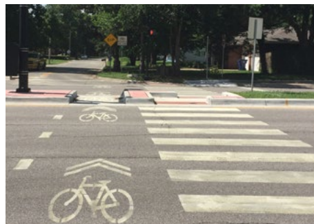
Median refuge with crosswalks in Wichita, KS