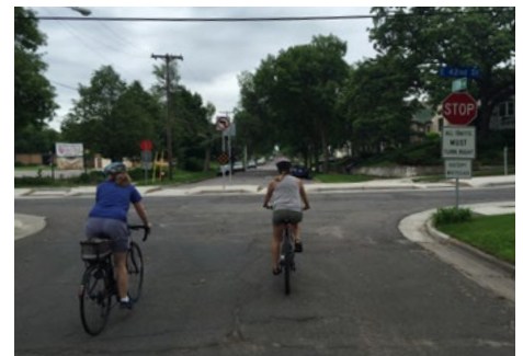
Full median refuge with closure in Minneapolis (17th Ave & 42nd St)