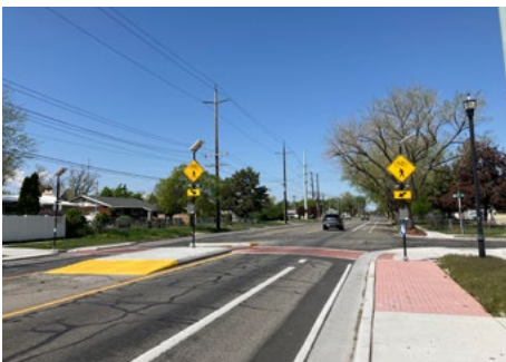
Median in Salt Lake City (1000 N 1300 W)

The median refuge island reduces the amount of distance that pedestrians and bicyclists are exposed to conflicting traffic and allows them to cross one direction of traffic at a time